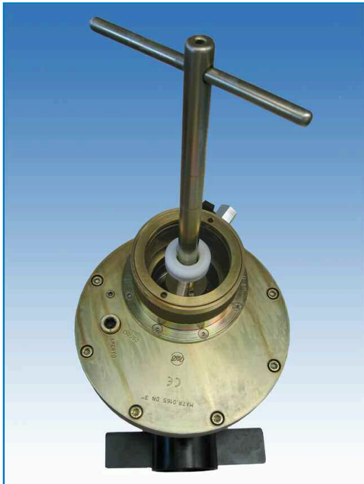
Esempio di utilizzo con asta porta tappi

Example of application with plug carrier